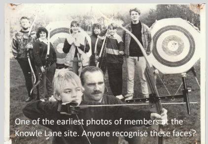
One of the earliest photos of members at the Knowle Lane site. Anyone recognise these faces?