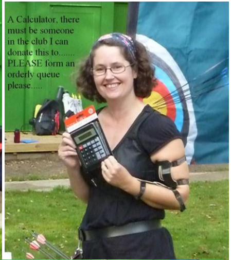
A Calculator, there must be someone in the club I can donate this to..... PLEASE form an orderly queue please.....