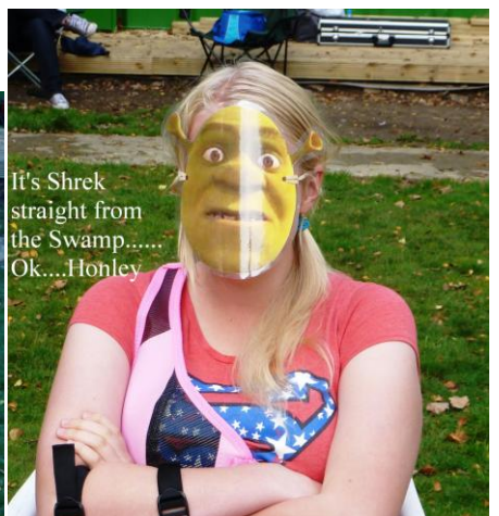
It's Shrek straight from the Swamp..... Ok....Honley