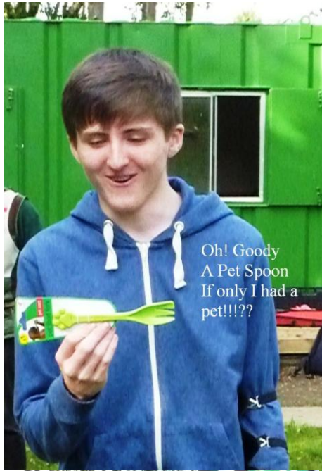
Oh! Goody A Pet Spoon If only I had a pet!!!!?