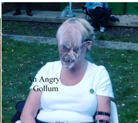
An Angry Gollum