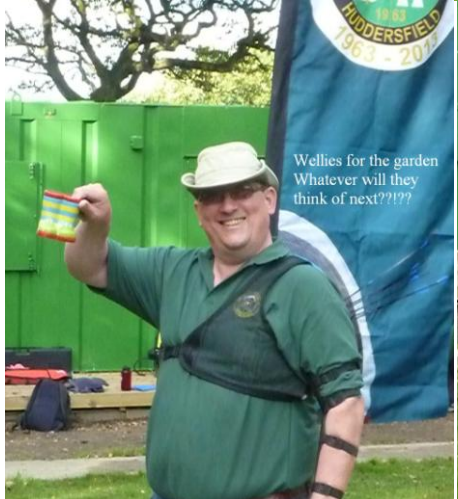
Wellies for the garden Whatever will they think of next????