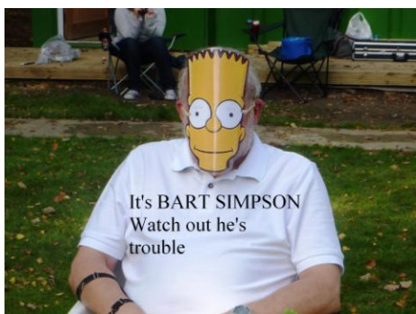
It's BART SIMPSON Watch out he's trouble

There was a unique opportunity within the celebrations that I could not resist. Without the committee's prior knowledge and agreement I invited a number of celebrities at great expense to join in with our 50 th Anniversary Celebrations. Here they all are watching on as the members were taking part in the shoot.